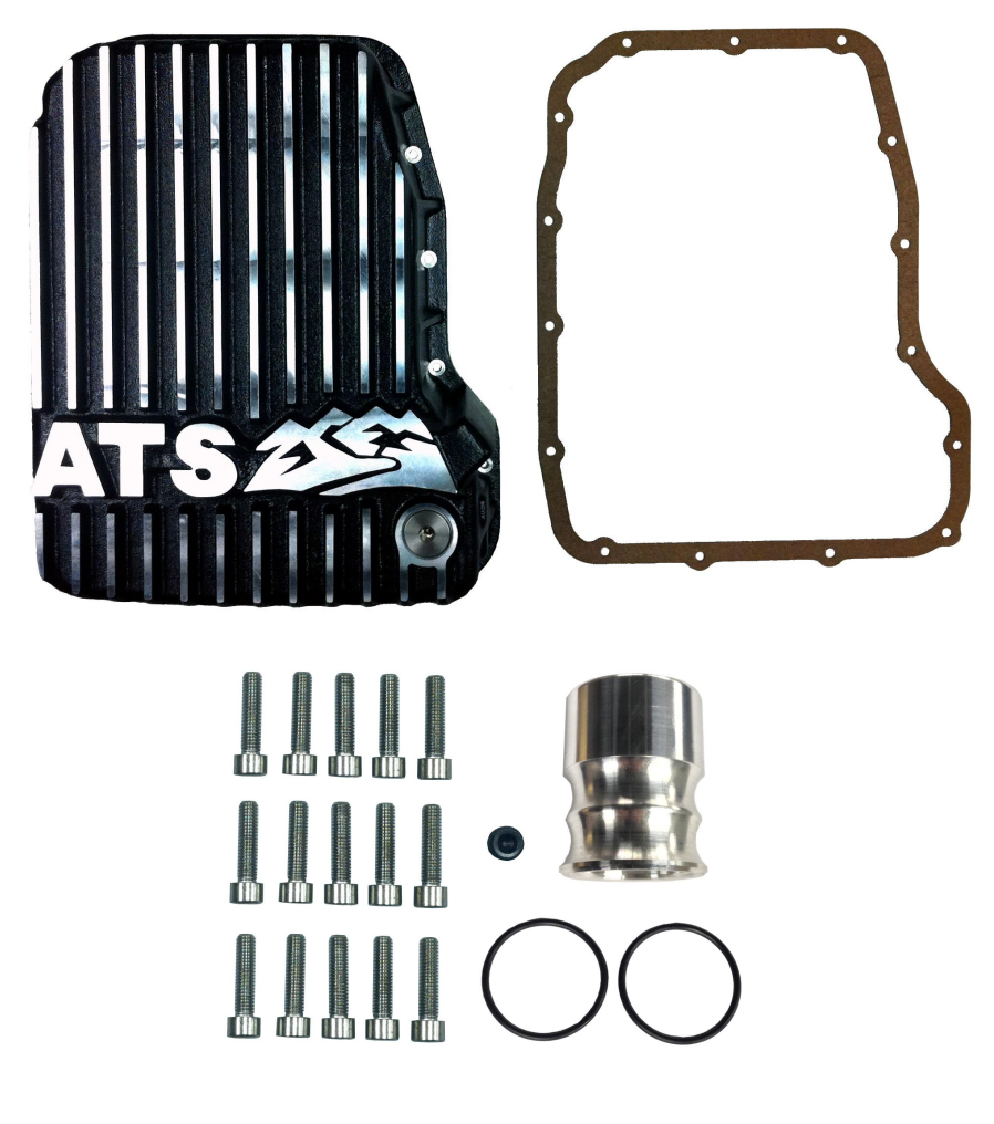
Figure 1 - 68-RFE Deep Pan Kit Contents

Items you may want to purchase before installation: